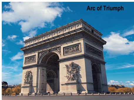
Arc of Triumph

Depart from home city for Paris, the capital of France.